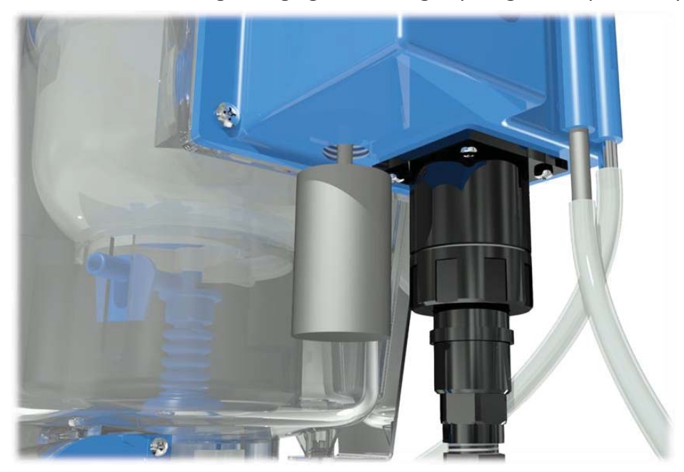
Figure 142 – Calibration Weight in position