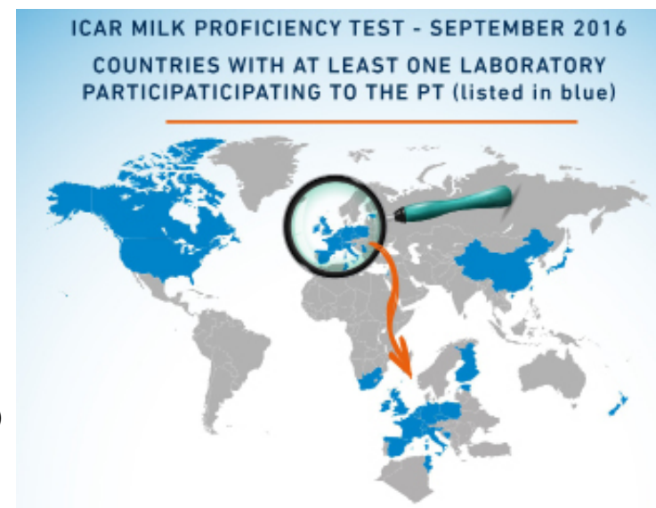
Geographic participation to the ICAR Proficiency Test in September 2016

The ICAR PT parameters considered in 2017 are: fat, protein, lactose, urea, somatic cell, beta-Hydroxybutyrate (BHB), pregnancy-associated glycoproteins (PAG) and the microorganism DNA PCR technique in cows' milk.