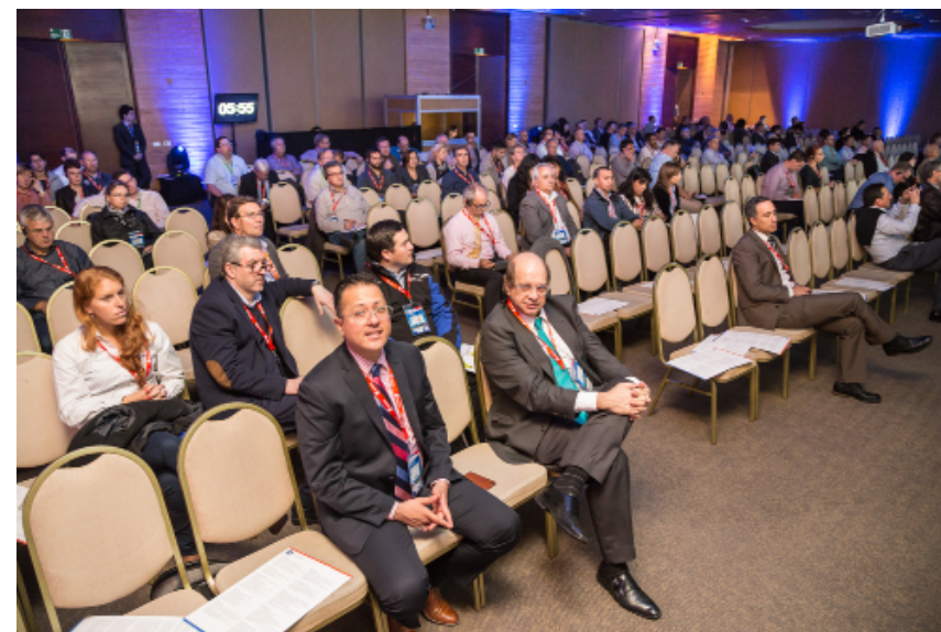
Participants to the ICAR General Assembly in Puerto Varas