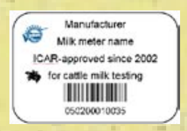
Figure 1. Tag example.

On the initiative of the Recording Devices Sub-Committee, ICAR is investigating a new service for manufacturers of milk recording devices. It has launched a tagging project consisting of the application of tags with the ICAR certification on the new milk recording devices to be produced from 1st January 2008. The ICAR Secretariat has invited all manufacturers to send information regarding each of approved milk recording devices, such as the name of the device, year of approval and specific indication (cow/sheep/buffalo milk).